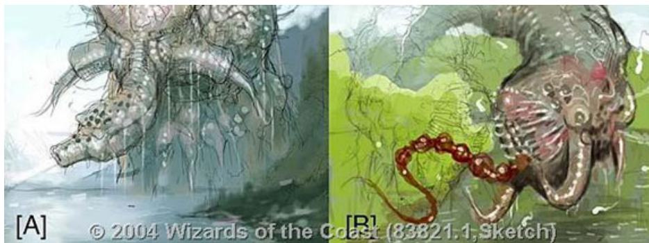
Sketches by Tsutomu Kawade

Interestingly, the last one here took an entirely new direction before it went final. But it ended up way cool .